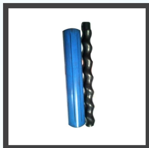
Rotor Stator Set