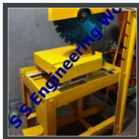
Refractory Bricks Cutting Machine