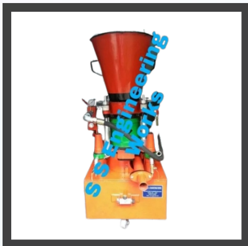
Industrial Shotcrete Machine