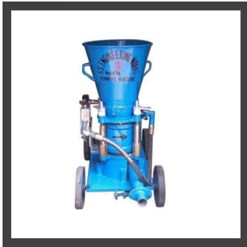
Refractory Gunning Machine