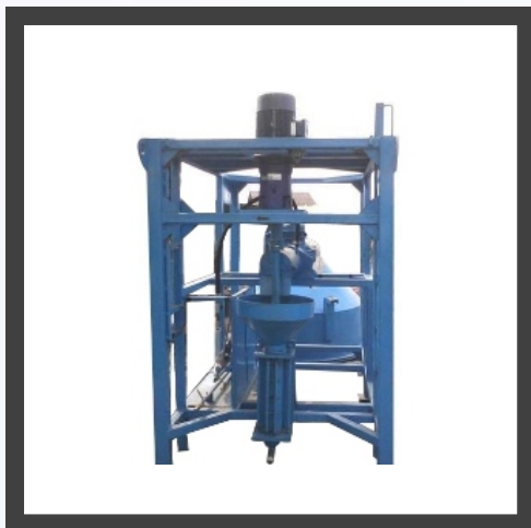
Tundish Spraying Machine