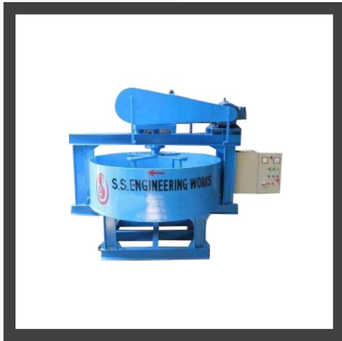
Industrial Pan Mixer