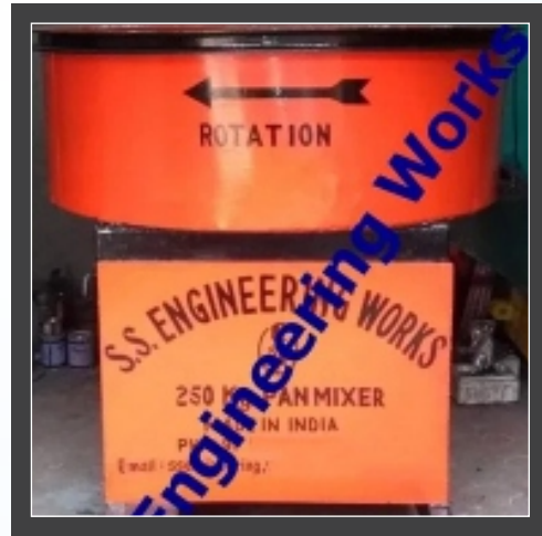
Refractory Castable Pan Mixers