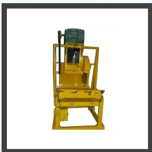
Industrial Bricks Cutting Machine