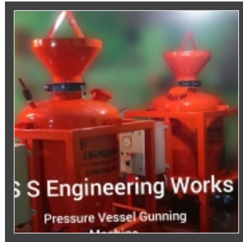
Pressure Vessel Gunning Machine